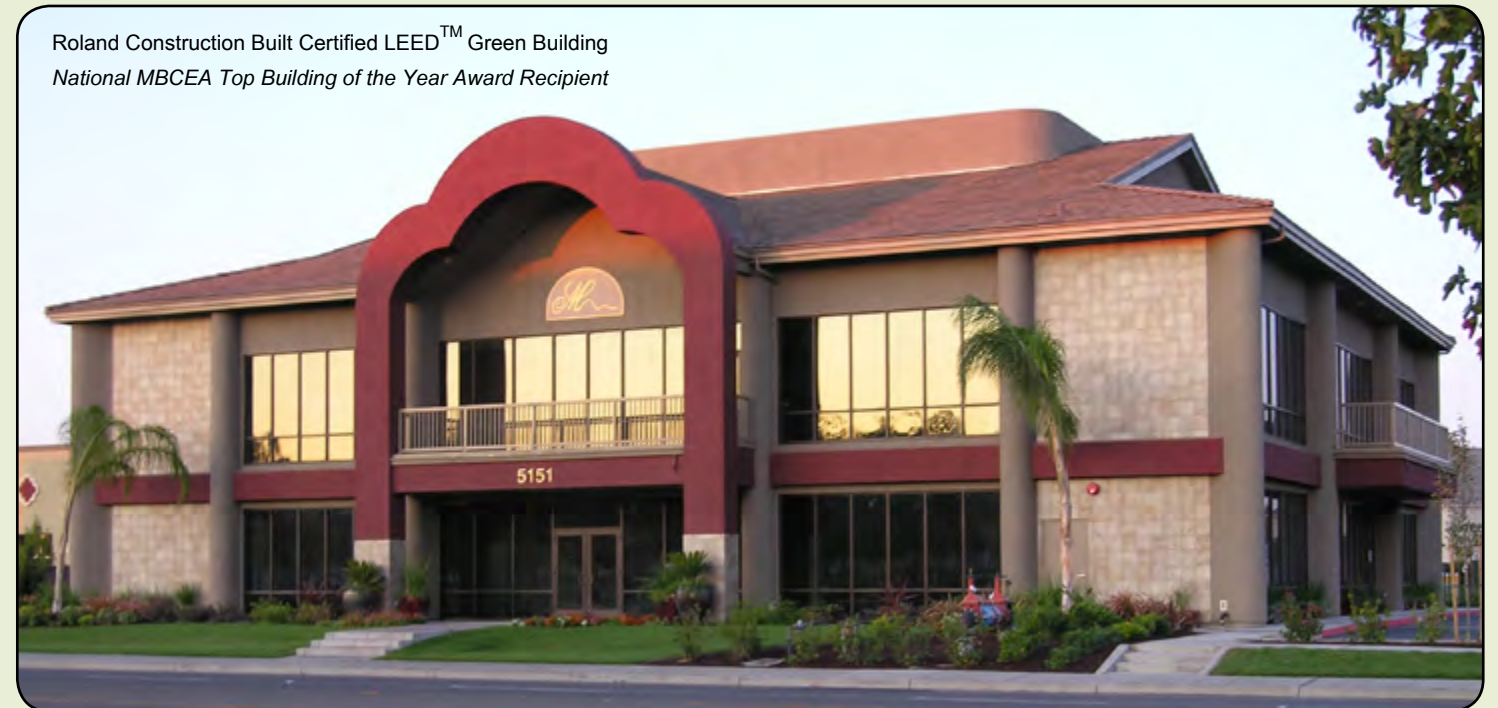
Roland Construction Built Certified LEED™ Green Building National MBCEA Top Building of the Year Award Recipient

The best opportunity for saving money on a construction project is during the planning and design phase.