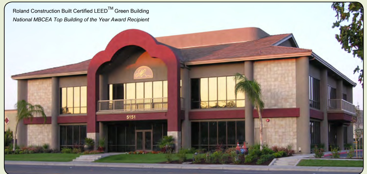
Roland Construction Built Certified LEED™ Green Building National MBCEA Top Building of the Year Award Recipient

The best opportunity for saving money on a construction project is during the planning and design phase.